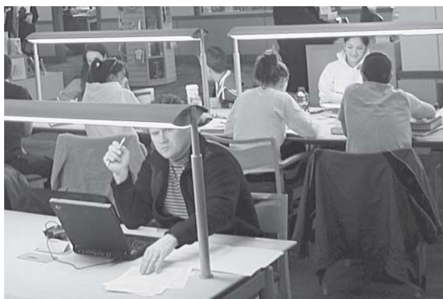
Over 70 computers are available for public use. You also can bring your laptop and take advantage of our plug-in and wireless Internet access.

–More than 900 people attended hands-on computer classes in the library’s computer lab. Classes covered topics such as how to use a computer, search the Internet, use the library’s catalog and use Microsoft Word and Excel.