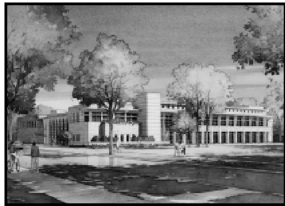
See a model of the new building at the library.

The new library building will offer expanded services and larger collections to meet Elmhurst's needs in the 21st century.